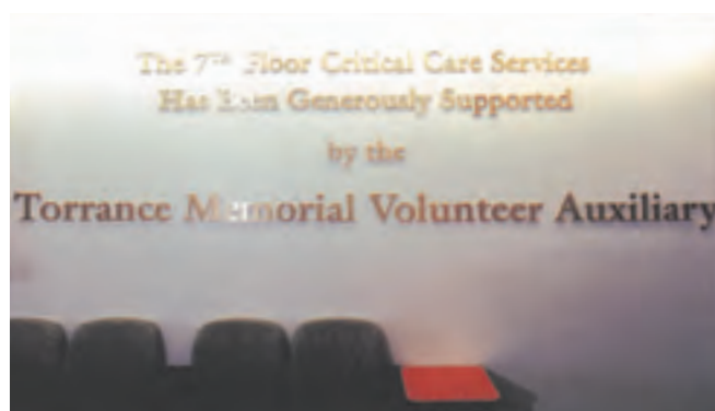
In honor of their generous support, the 7th floor Critical Care Unit was dedicated to the Torrance Memorial Auxiliary.