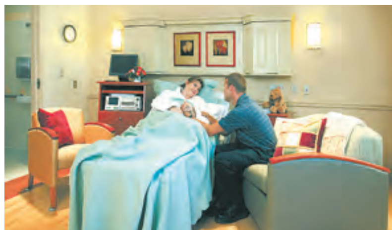
Family Birth Center

The Family Birth Center renovation has been supported by a $500,000 donation from the Weingart Foundation and a $150,000 donation from the Parson Foundation.