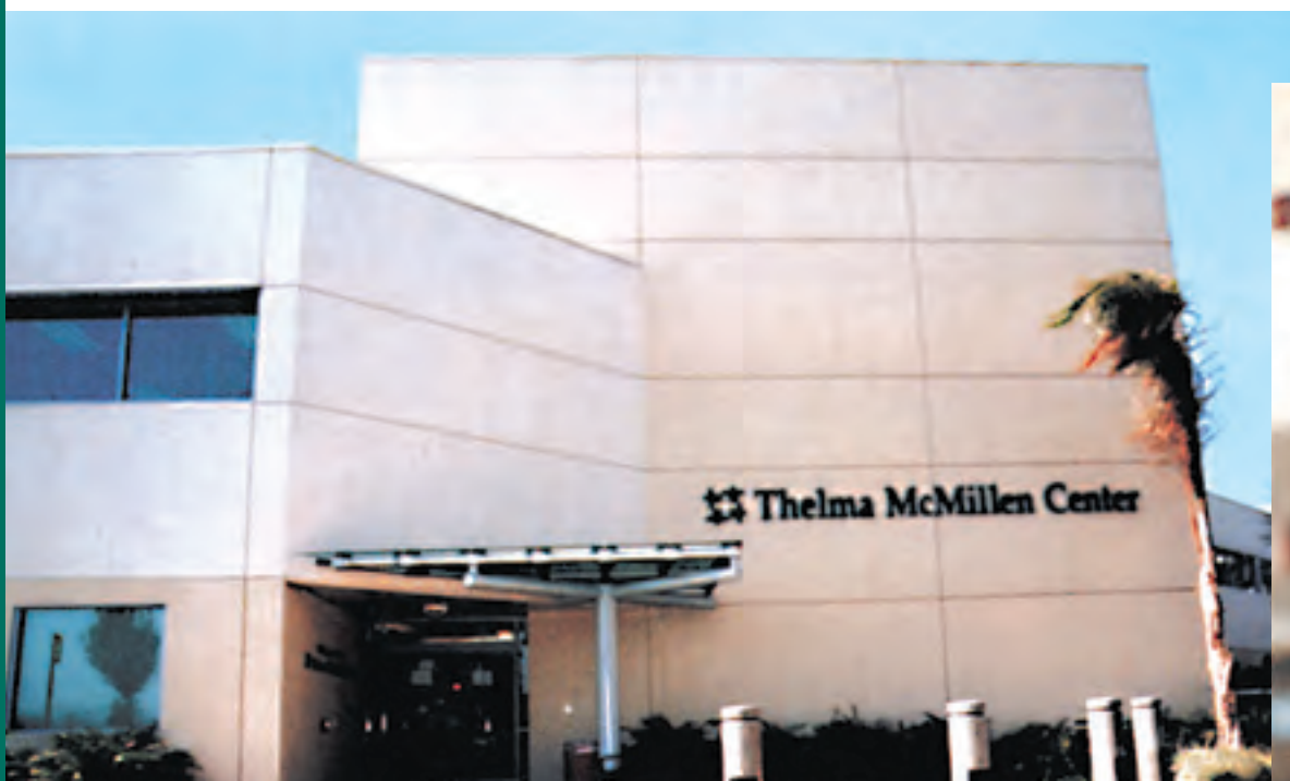
Thelma McMillen Center for Chemical Dependency Treatment